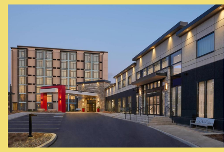
Mystery Conference Venue

The Annual Business Meeting and elections will be at the conference.